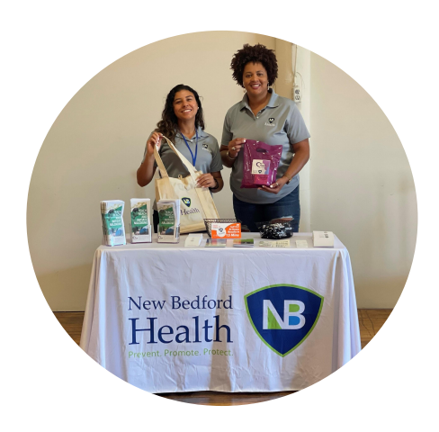
Health & Wellness Promotion

The Public Health Nursing Division monitors and tracks infectious diseases within our community in addition to providing preventative and supportive services to our residents