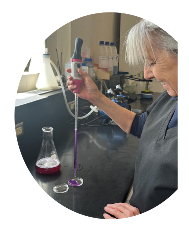
Municipal Marine Laboratory

The Environmental Health and Food Protection Division focuses on protecting residents & visitors from environmental threats.