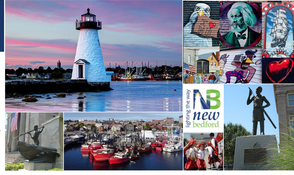
Historic | Fishing | Manufacturing | Cultural Diversity

Fishing and Manufacturing continue to be the largest industries.