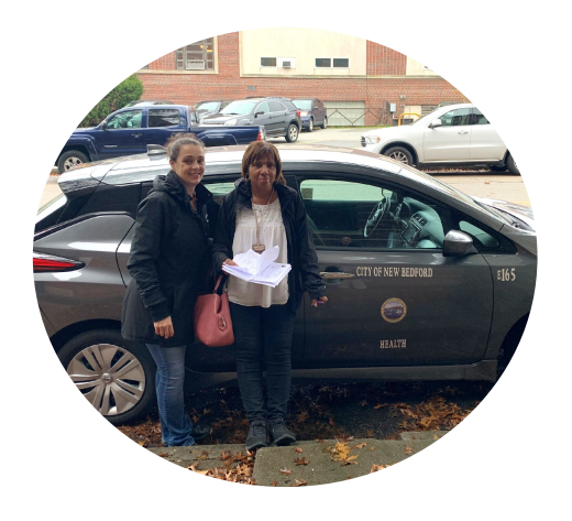
Environmental Health & Food Protection

These programs focus on prevention efforts and harm reduction activities to minimize consequences of both legal and illegal drug usage.