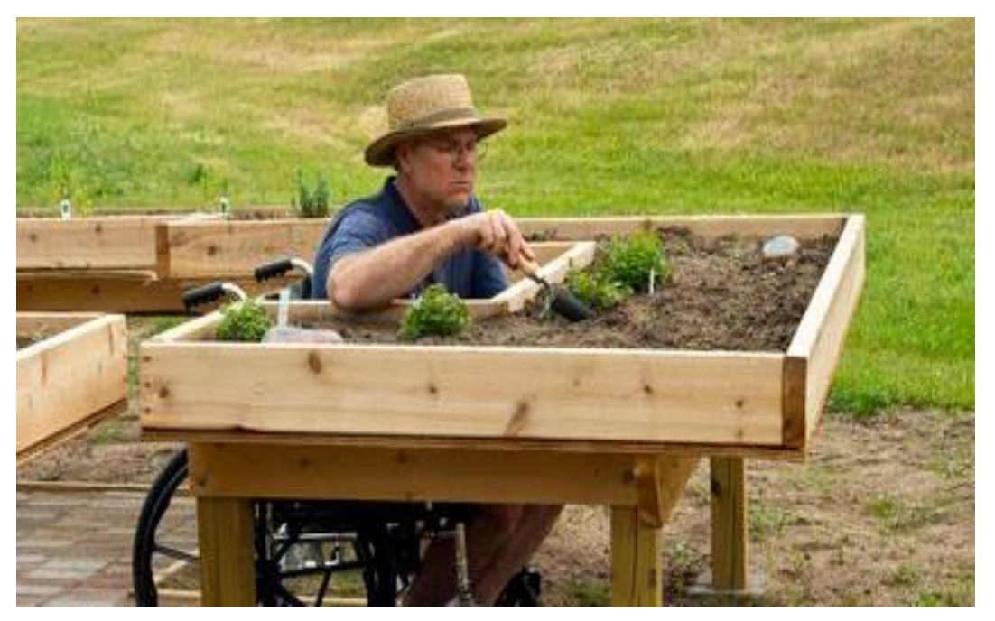
A raised garden bed