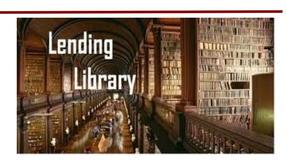
The MHOA Lending Library is always open!

Information about annual DEP and Community Sanitation Trainings can be found on Pages 6 & 7.